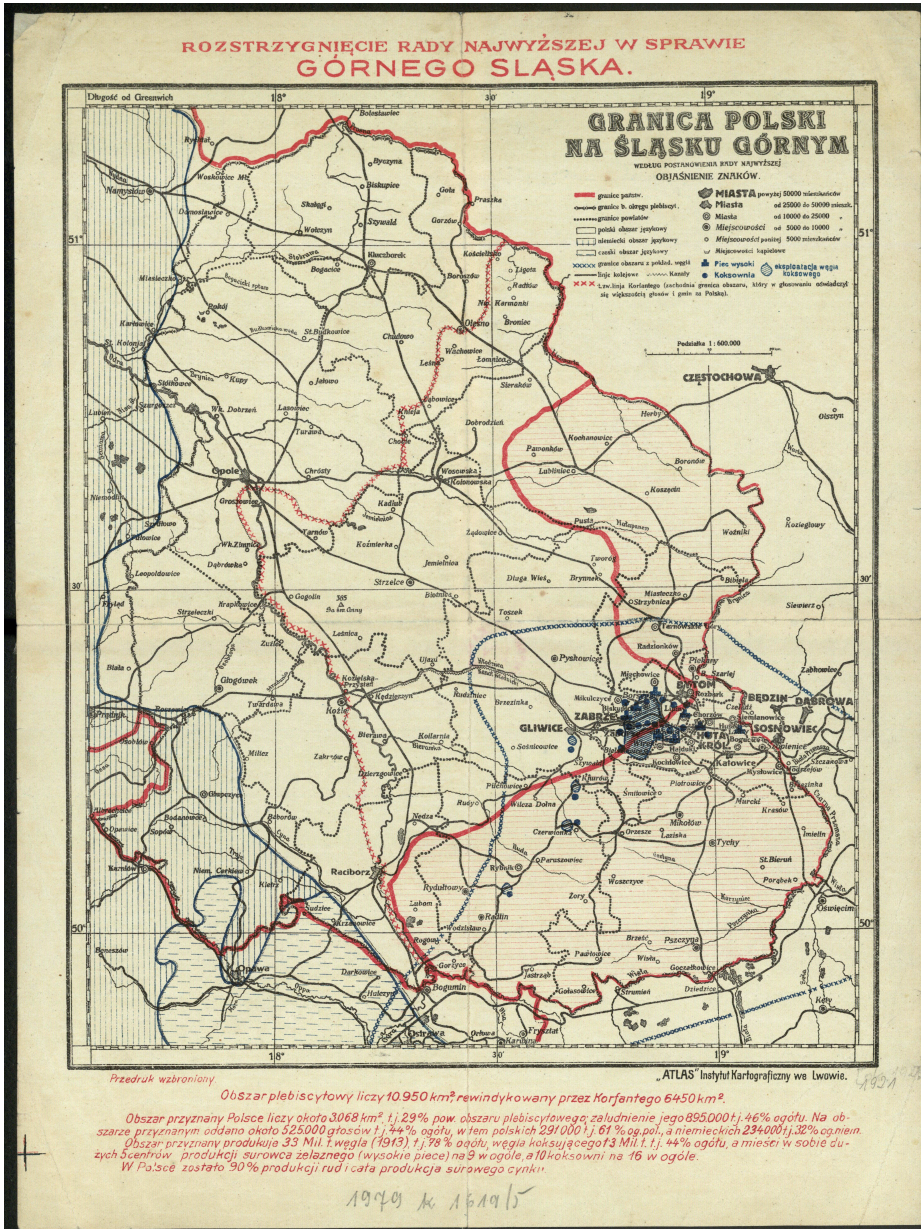
Fig. 2. Polish border in Upper Silesia: according to the decision of the Supreme Council of the League of Nations. Granica Polski na Śląsku Górnym: według postanowienia Rady Najwyższej , “Atlas” Instytut Kartograficzny (Lwów: Instytut Kartograficzny im. Eugeniusza Romera, 1921).