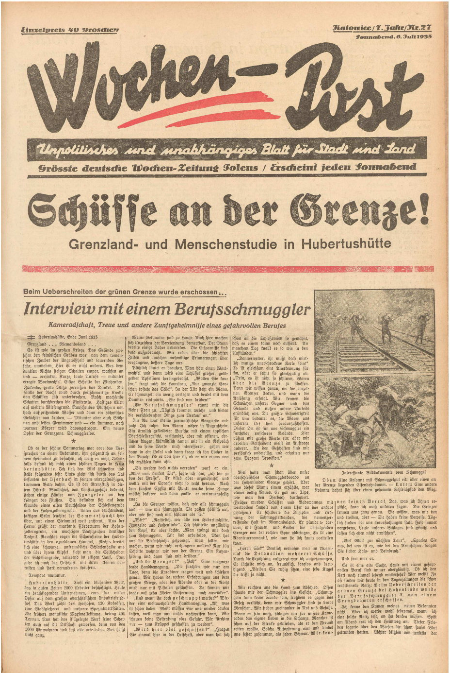
Fig. 3. Pictures printed in the article about crossing the green border. Georg Niffka, „Wochen-Post, 1935, Jg. 7, Nr. 27.