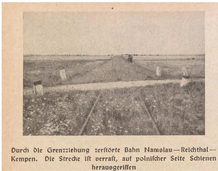
Fig. 5 One of the pictures printed in the article, criticizing the influence of the border on traffic connections. Georg Aurel Machura, Der Heimattreue Schlesier 1936, Jg. 1 (11), Folge 9, 184. Biblioteka Śląska, Katowice, Public domain

The so-called "Polish Corridor" near Hindenburg / Zabrze and Beuthen / Bytom (surrounded on three sides by a border) was highlighted in detail in German written accounts 79 . However, it was not only this road, where the old street was left "dead" 80 , that appeared as a zone of reduced human activity. In a 1936 issue of the national socialist "Der Heimattreue Schlesier" a two-page article focuses on the implications of the "Diktat von Versailles" 81 in the districts of Wartenberg / Scytów and Namslau / Namysłów. In addition to mentioning that some fields