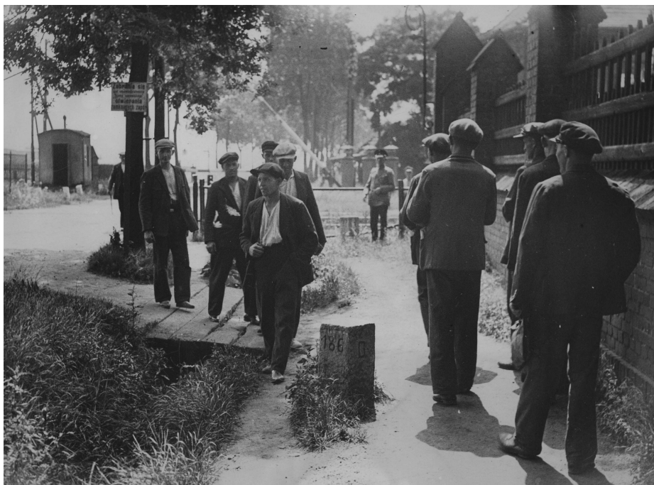
Fig. 4. Border crossing in Upper Silesia, on the Polish-German border [1933]. Narodowe Archiwum Cyfrowe, Zespół: Koncern Ilustrowany Kurier Codzienny – Archiwum Ilustracji, CN 3/1/0/8/6448. „Przejście graniczne na Górnym Śląsku, na granicy polsko-niemieckiej [1933]”. Narodowe Archiwum Cyfrowe, Public domain.

2,000 workers and produced more than 400 tonnes of steel per month, but was now abandoned. The author refers to it as “one of the many victims in the Upper Silesian industrial cemetery” 68 . The depictions of nature were used to contrast the apparent decay of the industrial site. For example, the author notices the “juicy green” 69 in which the entrance to the former mine is now located, and also the clear sky, as the large winding tower no longer produces smoke. However, the clear sky is also viewed negatively because the tower is depicted as a symbol of German engineering. These industrial aspects of the site were clearly valued more highly than the recurring natural aspects, although their environmental detriment was noted through the description of an “unfriendly” 70 black slack heap at the site. Similar to later accounts of areas with reduced human activity, nature in this account seems to be regaining or reconquering a vacuum created by the new border in its ultimate vicinity. However, in contrast to those narratives, it is seen in a melancholic way and as a negative consequence rather than a positive side effect of a border otherwise negatively perceived.