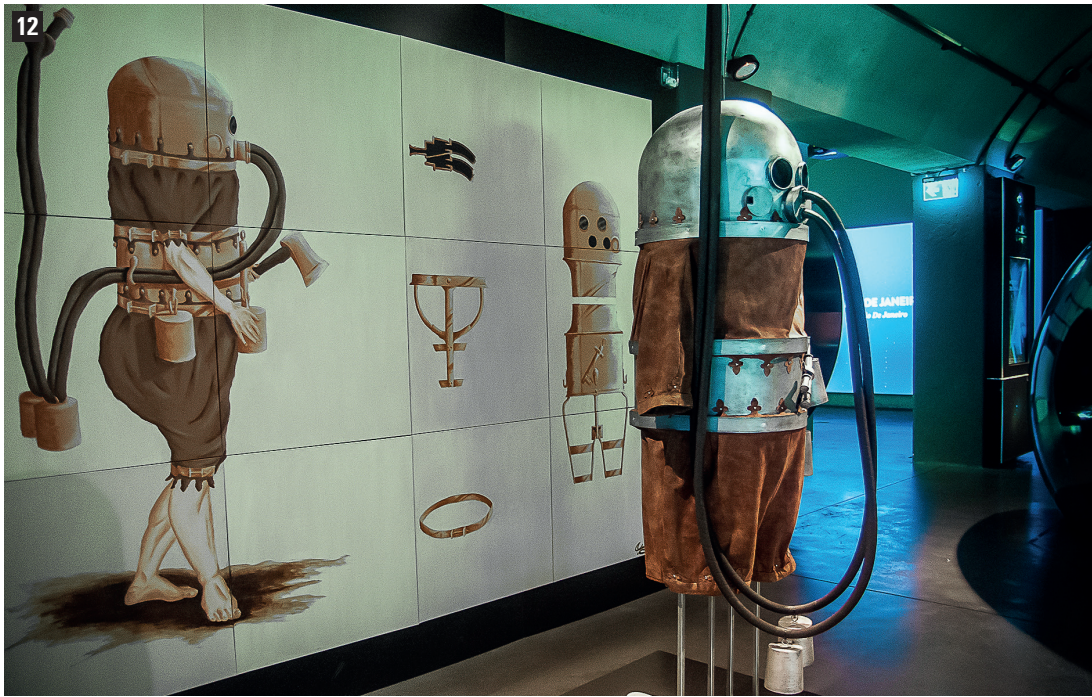
Photo 12 Replica of Karl Heinrich Klingert's diving suit – one of the world's first diving suits. City and Water Zone