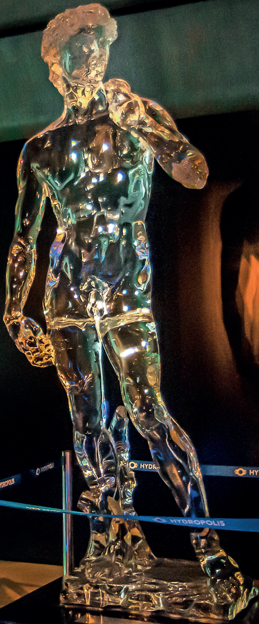
Acrylic copy of Michelangelo's David sculpture. Man and Water Zone