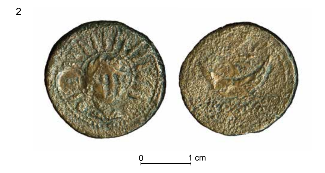
Fig. 3. Selected Roman Republican bronze coins recorded in Poland.

1 — Zbylitowska Góra, powiat Tarnów, województwo podkarpackie, Poland. Roman coin: Republic, as, after 211 BC, Rome; Photo by R. Moździerz (Regional Museum in Tarnów); 2 — Szczecin-Golęcino, the capital city of w. zachodniopomorskie, Poland. Roman coin: Republic, uncia, 217–215 BC, Rome; Photo by G. Solecki (National Museum in Szczecin).