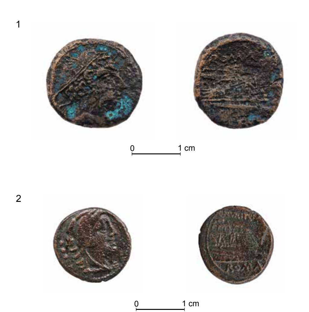
Fig. 2. Selected Roman Republican bronze coins recorded in Poland; Photo by H. Górecki (Museum in Jarosław, The Orsetti House).

1 — Węgierka, powiat Jarosław, województwo podkarpackie, Poland. Roman coin: Republic, semuncia, 217–215 BC, Rome; 2 — Wola Buchowska, powiat Jarosław, województwo podkarpackie, Poland. Roman coin: Republic (C. Numitorius), quadrans, 133 BC, Rome.