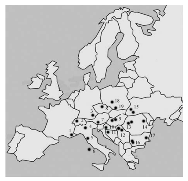
Fig. 2. Distribution of main Cenozoic meta-lignite and sub-bituminous coal deposits and their uneconomic occurrences in Europe. Coal ranking – see in Table 3

Manosque (France), 2 – Limestone Alps (Switzerland), 3 – Hirschberg and Meissner (Germany), 4 – Vicenza-Verona (Italy), 5 – Bagnasco (Piemont-Ligurian Basin – Italy), 6 – Nuraxi-Figus