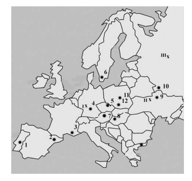
Fig. 1. Distribution of main Paleozoic and Mesozoic meta-lignite and sub-bituminous coal deposits and their uneconomic occurrences in Europe. Coal ranking is presented in Table 3

Paleozoic and Mesozoic coal deposit and uneconomic occurrences: 1 - Coimbra-Abrantes (Portugal), 2 - Utrillas (Spain), 3 - Fuveau (France), 4 - Mittelborn (Germany), 5 - Moravska Trebova