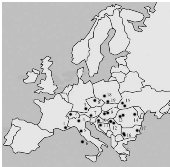
Fig. 2. Distribution of main Cenozoic meta-lignite and sub-bituminous coal deposits and their uneconomic occurrences in Europe. Coal ranking – see in Table 3