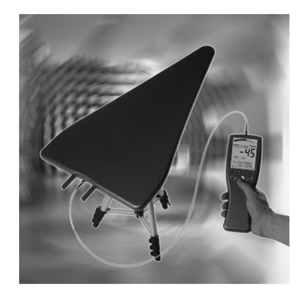
Fig. 2. Spectran HyperLOG Antenna [1].

To explore the radio frequency signatures prevalent in the environment it was decided to use off the shelf components. A Spectran Spectrum analyzer (Figure 2) was employed to detect radiation and their respective signal strengths. The analyzer is manufactured by Aaronia AG. It uses digital signal processing to extract and filter the characteristics of the radio frequencies. It is designed to identify a frequency range of 10MHz to 6GHz.