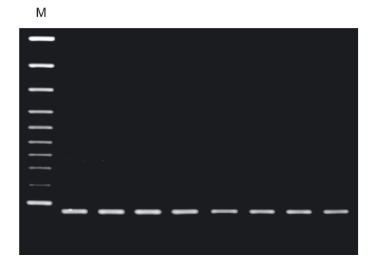
Fig. 1. Examples of species-specific PCR products for (A) F. oxy-sporum (534 bp) and (B) F. culmorum (472 bp). Lane M – Gene Ruler ™ 100 bp DNA Ladder Plus (Fermentas)