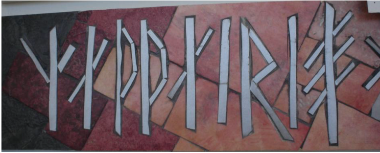
Illustration 3: “meþ þæiri ø...”. Part of a runic decoration featuring Maeshowe 20 in Kirkwall Bus Station.