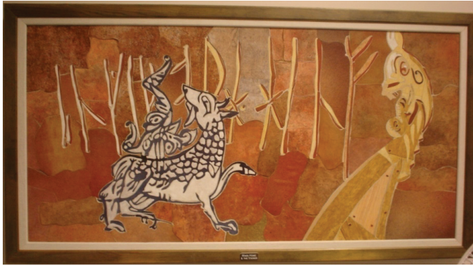
Illustration 2: Artwork representing Maeshowe at Kirkwall airport.

The Maeshowe picture in the airport (Illustration 2) contains an exact copy of part of Maeshowe inscription number 9 (numbering from Barnes 29 ), reading ingibjorg hin f . The full inscription, in Michael Barnes' normalisation, reads "Ingibjorg, hin fagra ekkja. Mǫrg kona hefir farit lút inn hér. Mikill ofláti. Erlingr" translating as "Ingibjorg, the fair widow. Many a woman has gone stooping in here. A great show-off. Erlingr." 30 This inscription is perhaps the most famous out of the Maeshowe assemblage. As will be shown below, the Maeshowe inscriptions also feature in locally produced jewellery.