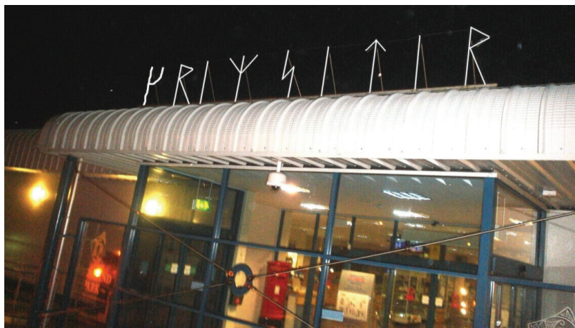
Illustration 1: Main entrance at Kirkwall Airport Grimsetter, Orkney Islands.

Also inside the airport, runes are visible in artwork decorating the public space and on jewellery laid out in display cabinets. The artwork consists of a number of large depictions of Orkney scenes made out of vinyl, including one representing Maeshowe, showing a runic inscription, the Maeshowe Dragon, and the prow of a Viking ship, the (modern) original of which is to be found outside the Orkneyinga Saga Centre in Orphir (see Illustration 2).