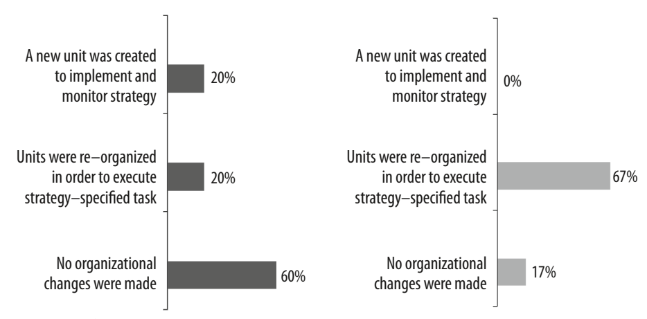
Figure 3. Organizational changes supporting an implementation process in public schools in Poland

In most of the discussed public schools of higher education strategy implementation was not supported by any changes in the adopted structural solutions (figure 3). Only 20% of the schools included in the research, which implemented their strategies, created organizational units responsible for strategy implementation. A similar percentage of public schools re-organized existing organizational units to execute strategy-oriented tasks.