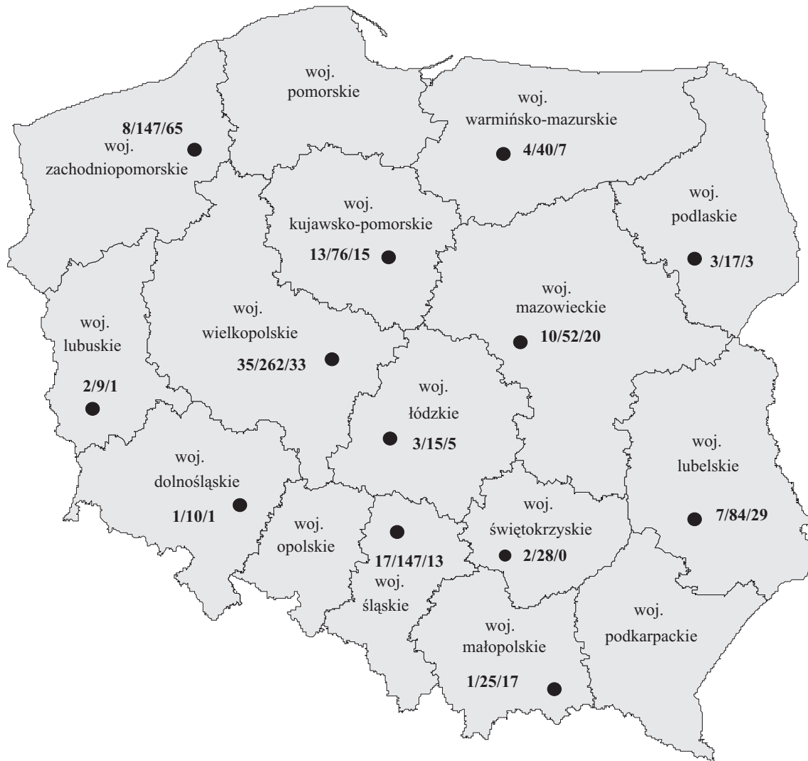
Fig. 1. Results of isolation of Bbr . Legend: red dot – provinces from which samples were tested, first number – number of farm tested from individual province, second – number of samples tested, third – number of Bbr isolates.